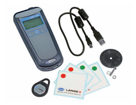
RFID locator LOC100 with coloured RFID tags for samples, robust RFID tags for the sampling location, and RFID tags for users

The LINK2SC connection between the photometer and the SC Controller allows process results and laboratory reference values to be compared directly on the photometer. Data can be exchanged via the Ethernet in both directions, meaning matrix corrections for process probes can be performed directly by the laboratory.